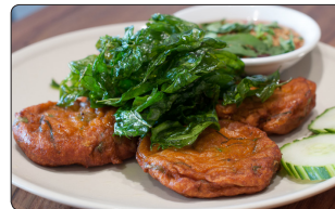
5. ก้อนปลา (N) (GF) $9 Thai Fish Cakes (4) Fish mince mixed with curry paste and Thai herbs served with sweet chilli sauce