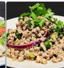
15. ยำหมู $15.90 Larb Spicy mince salad with red onion, lemon juice, dried chilli and herbs