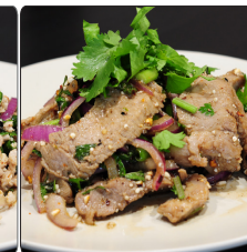
16. ยำหมู $17.90 Numtok Spicy grilled meat salad with red onion, lemon juice, dried chilli and herbs