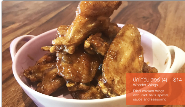
ปีกไก่วันเดอร์ (4) $14 Wonder Wings Fried chicken wings with PadThai's special sauce and seasoning