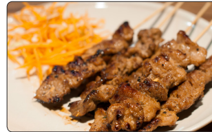
7. หมูปิ้ง $10 Pork Skewers (5) Grilled pork skewers served with smoked chilli and tamarind sauce