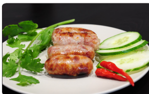
4. ไส้กรอกอีสาน $8 Thai Sausages (4) Sausage of fermented pork and glutinous rice served with fresh vegetable