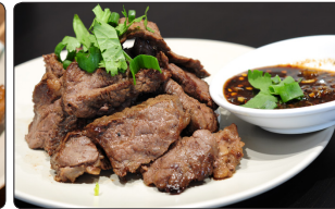
8. เสือร้องไห้ $12 Grilled Beef Grilled beef served with smoked chilli and tamarind sauce