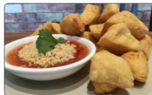
3. เต้าหู้ทอด (V) (N) (GF) $8 Fried Tofu Deep fried tofu served with peanut sauce