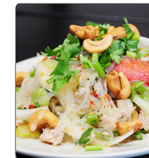
14. ยำวุ้นเส้น $15.90 Glass Noodle Spicy Salad with Mince Spicy salad with glass noodle, tomato, onion, lemon juice, fresh chilli and cashew nut (N) (GF) (V) (P) (D)