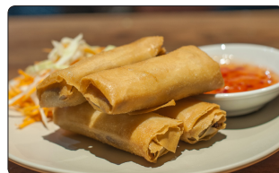
1. ปอเปี๊ยะทอด (V) $8 Vegetarian Spring Rolls (4) Crispy wheat pastry wrapped rolls with vegetable filling served with sweet chilli sauce