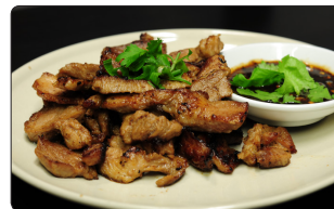
9. หมูย่าง $12 Grilled Pork Grilled pork served with smoked chilli and tamarind sauce