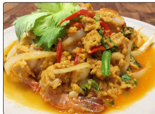
กุ้งผัดพริกแกง (D) $18 Stir Fried Prawn with Curry Powder and Egg Stir fried prawn with curry powder, egg, chilli jam, celery, onions, and spring onion