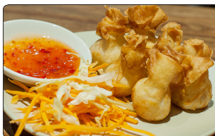
2. กุ้งทอง $8 Prawn Parcels (5) Deep fried prawns wrapped with crispy wheat pastry