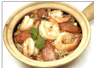
ข้าวอบหม้อดิน (N) $18 Rice with Chinese Sausage and Prawn in Clay Pot Rice potted with Chinese sausage, prawn, spring onion, sweet radish and cashew nuts