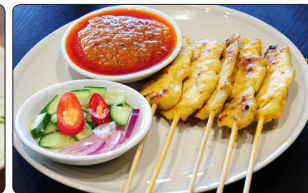
6. ไก่เสฉี่ (N) $10 Chicken Satay Skewers (5) Chicken satay skewers served with smoked chilli and tamarind sauce