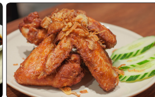
10. ปีกไก่ทอด $12 Chicken Wings (4) Deed fried marinated chicken wings served with sweet chilli sauce